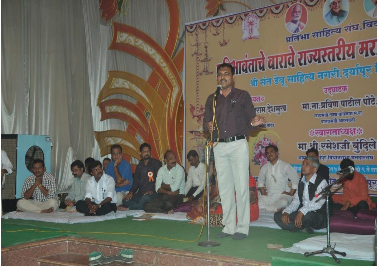
Presenting Poem In Rajyastariya Kavi Sammelan Daryapur