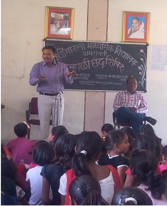
Delivered speech on personality development in vidyabharti vidyalaya,Amravati. 24april 2015